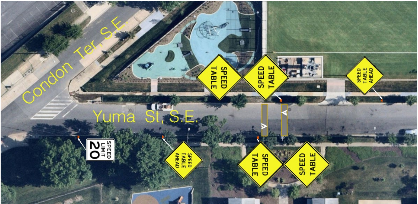
Figure 1: Proposed Improvements along Yuma Street, S.E. east of Condon Terrace.