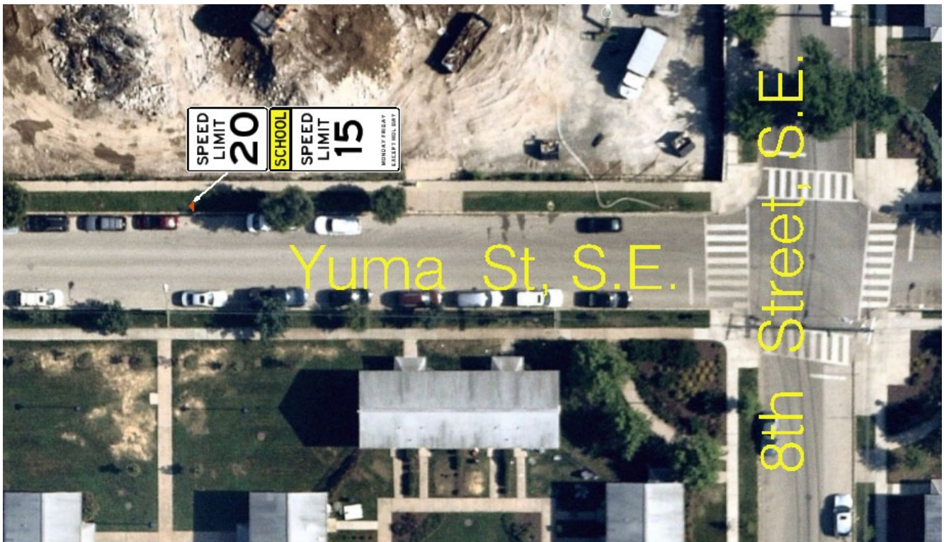
Figure 3: Proposed Improvements along Yuma Street, S.E. west of 8 th Street, S.E.