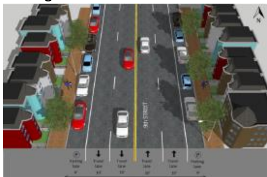
Existing Cross Section