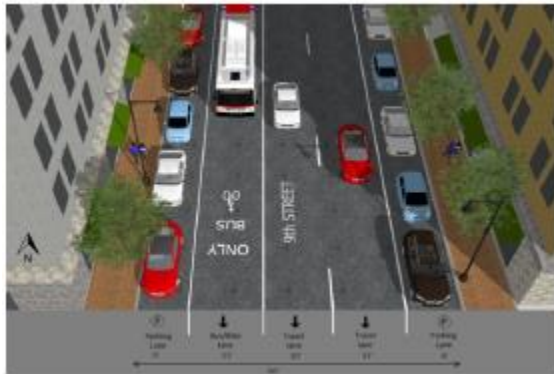
Existing Cross Section