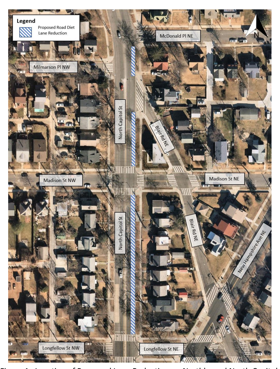
Figure 1: Location of Proposed Lane Reduction on Northbound North Capitol Street