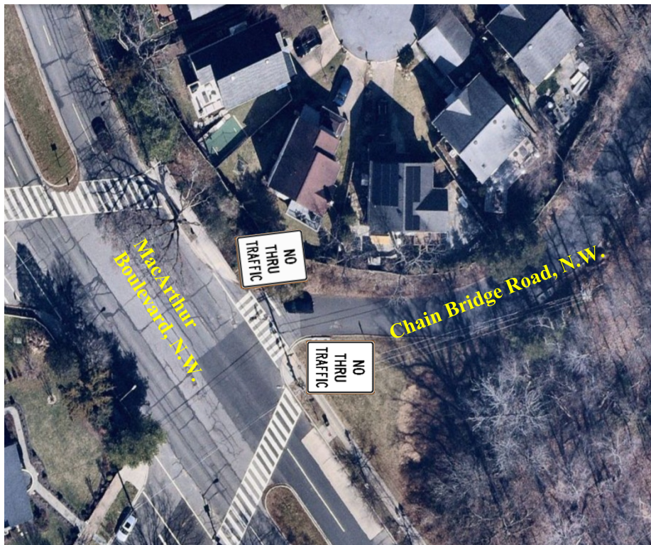
Figure 4: Proposed Traffic Signs at Chain Bridge Road and MacArthur Boulevard, N.W.