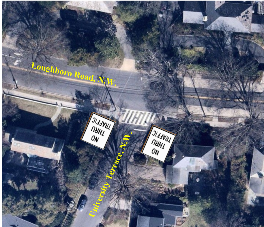
Figure 1: Proposed Traffic Signs at University Terrace and Loughboro Road, N.W.