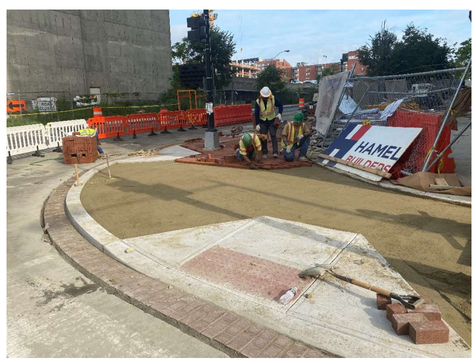
Picture No. 9 – 08/21/2020 – Brick sidewalk being installed at the NE corner of the intersection of H St. and 2<sup>nd</sup> St. (North View)