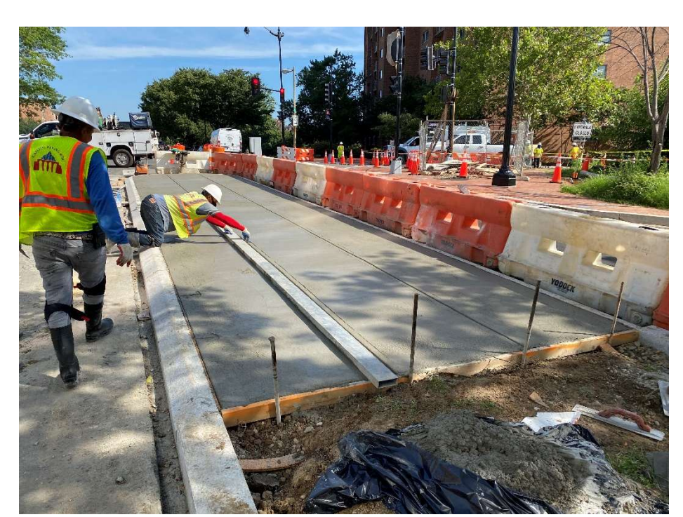
Picture No. 7 – 08/20/2020 – PCC median strip at the intersection of NJ Ave, 2<sup>nd</sup> St and I St. (North View)