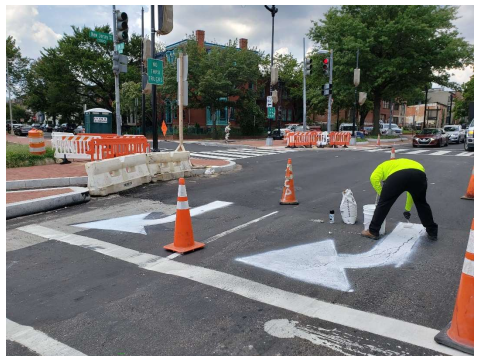
Picture No. 8 – 08/20/2020 – Placement of temporary pavement markings at the intersection of NY Ave and NJ Ave (North View)