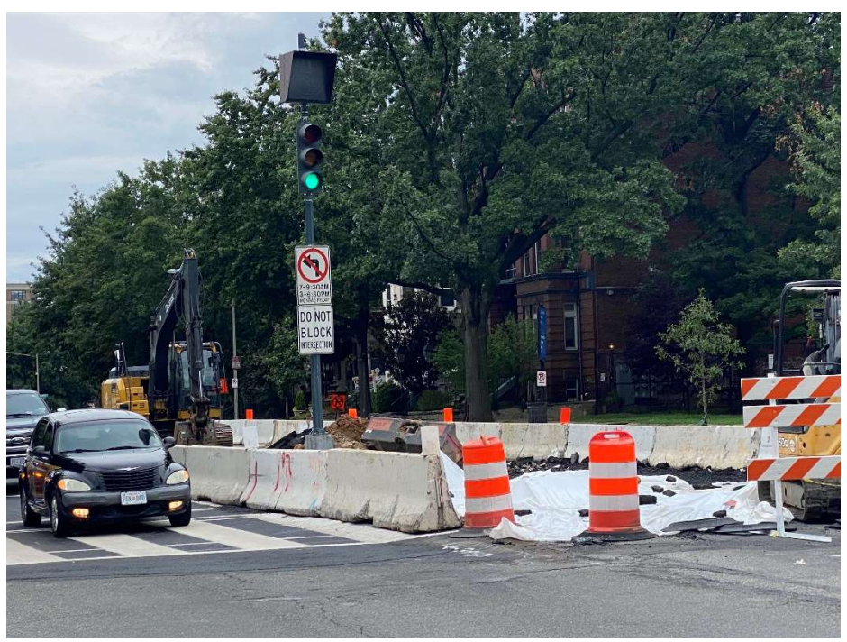
Picture No. 5 – 08/19/2020 – Inspection of MOT at the intersection of NY Ave and NJ Ave. (East View)