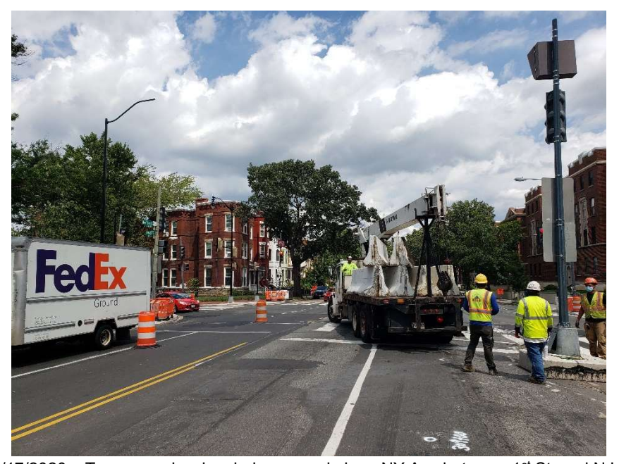
Picture No. 2 : 08/17/2020 – Temporary barriers being moved along NY Ave between 1<sup>st</sup> St. and NJ Ave. for Phase 4 switch (East View)