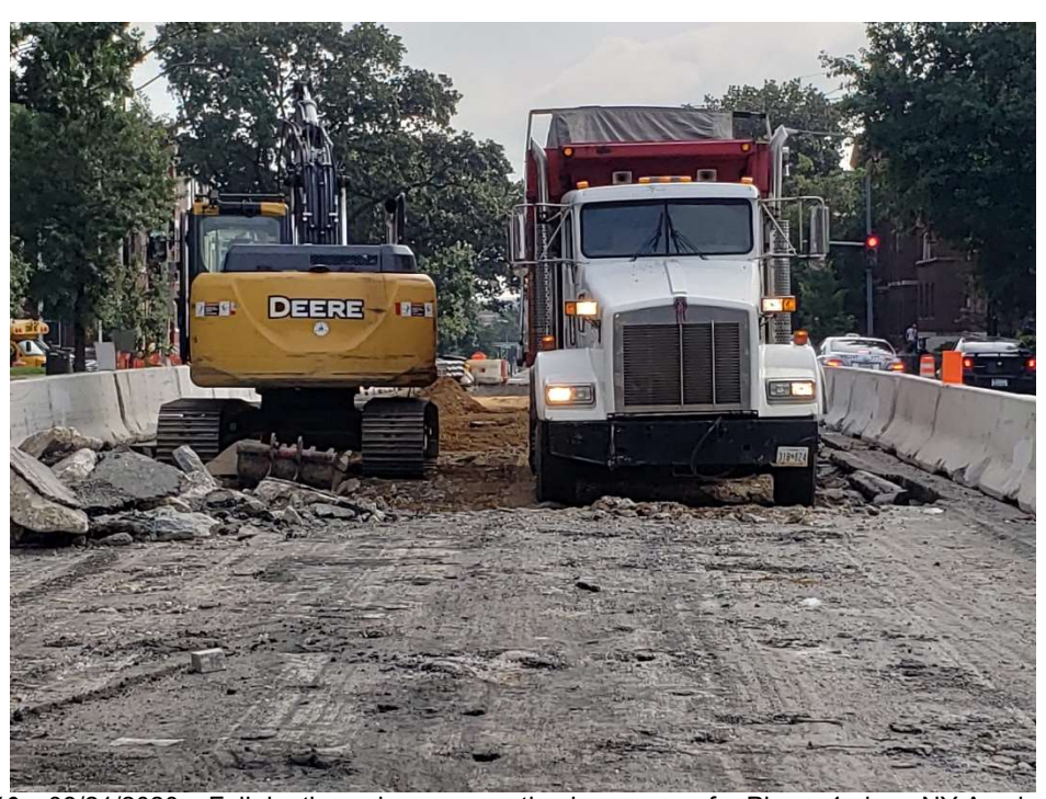
Picture No. 10 – 08/21/2020 – Full depth roadway excavation in progress for Phase 4 along NY Ave between 1st St. and M St. (East View)