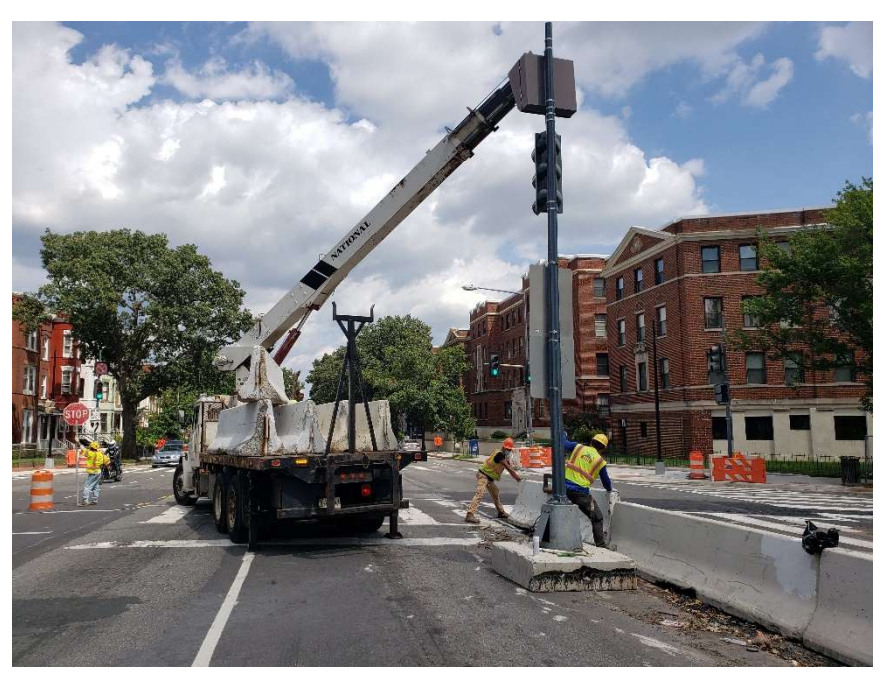
Picture No. 1: 08/17/2020 – Temporary barriers being moved along NY Ave between 1st St. and NJ Ave. for Phase 4 switch (East View)