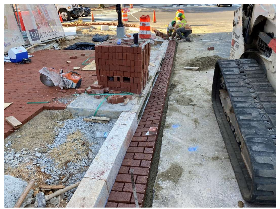
Picture No. 6 – 08/20/2020 – Installation of brick gutter in progress at NE corner of 2<sup>nd</sup> St. and H St. (South View)