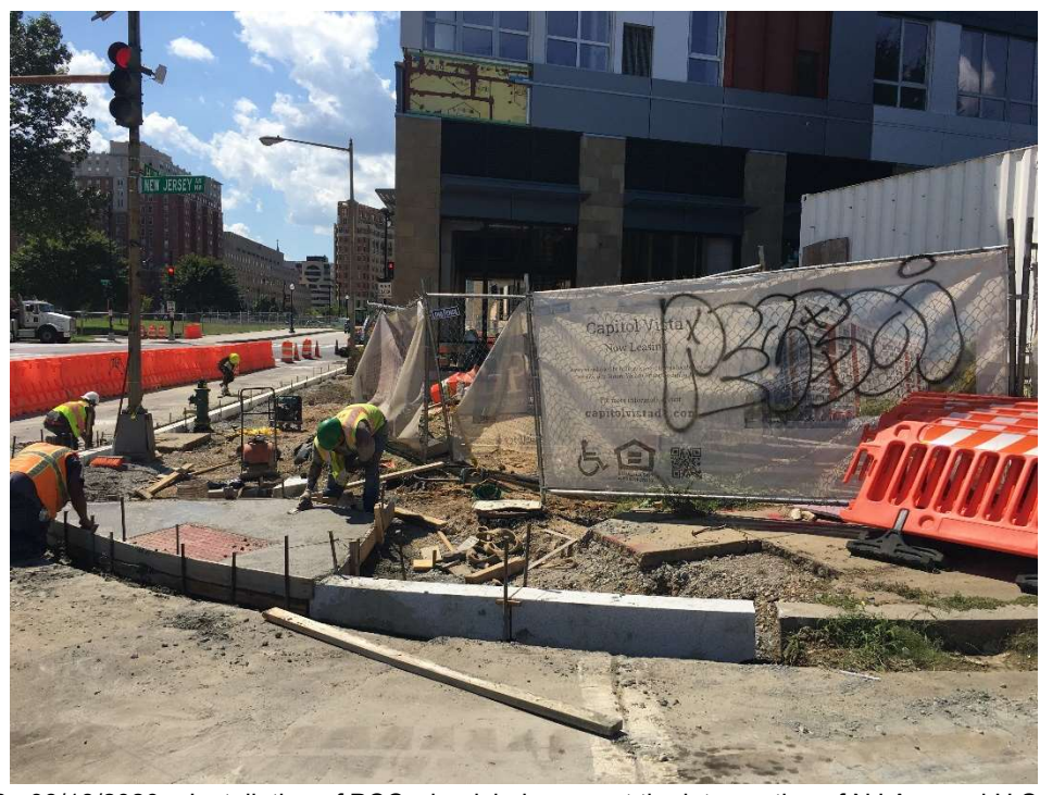
Picture No. 3 - 08/18/2020 – Installation of PCC wheelchair ramp at the intersection of NJ Ave and H St., NW corner (West View)